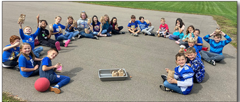
Above: Ridge Road students enjoy a sunny day. Below: The High School Greenroom Players presented The Little Mermaid in March.

Non-Profit Org. U.S. Postage PAID Permit #5 Elmira, NY