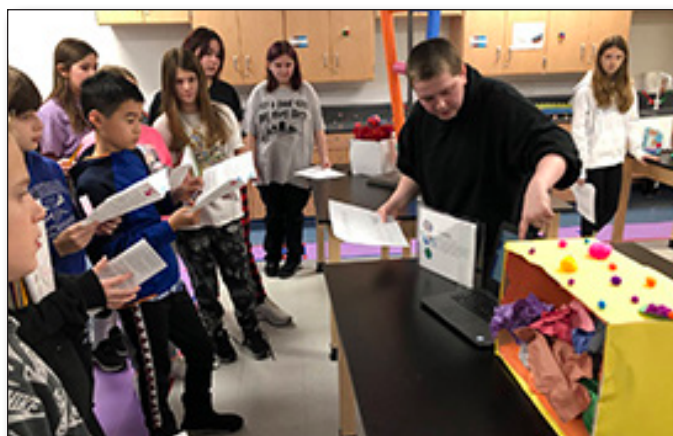
In October, seventh-graders created museum exhibits of organelles and their roles and significance to the overall function of a cell. They then presented what they learned to groups of Intermediate School students and their fellow students at the Middle School.