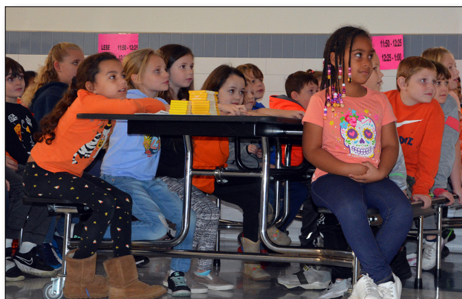
Center Street students celebrated Unity Day in October. They attended an assembly to learn about the day and to decorate puzzle pieces to be placed together in a display at the school. The puzzle pieces reminded students that they are all unique, but they all fit in.

Maintaining a replacement schedule allows the district to keep its bus fleet in good working order, minimizing maintenance needs. The district's Transportation Department has a current bus inspection passing rate of 99.6% as a result of the regular care they take in maintaining buses while minimizing costs.