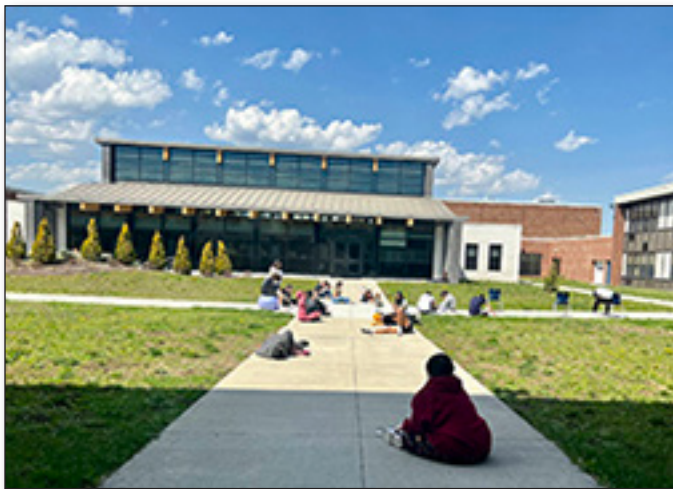
Students studying in the courtyard at the High School on a sunny day in April.

Reason(s) for running: “I am choosing to run for the Horseheads Central School District Board of Education for the following reasons: I have a varied skill set, perspective, and background as a community member, district parent, former Horseheads educator, and building/district level administrator that can benefit the District and help to push forward goals for student and staff excellence. I come to this candidate process as a servant leader. I wish to make use of my extensive background and skill set in education to make a positive impact on students and teachers in my community. I am an advocate for all students, staff, and teachers. My first questions will be: “Is it best for students?” and “Is it best for staff and teachers?”. These attributes would allow me to be a voice for current and new initiatives that the District is working toward: 1) Educational leader at the building, District, and regional levels, 2) Educational program/system builder (Online Learning, Alternative Education), 3) Professional Developer for Teachers and Administrators, 4) Success with Culture Building, 5) Deep understanding and advocate for the Career and Technical Education pathways.