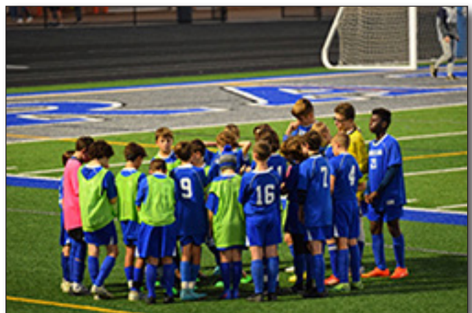
The Boys' Modified Soccer Team played at the district stadium in the fall. The football team stayed after their practice to wish the team well.

You do not need to vote on the budget to vote for a district image.