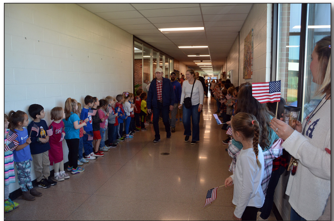
At Gardner Road's Veterans Tribute in November, students invited relatives and friends who have served in the military or are currently serving to the school for breakfast, a parade through the hallways, and a concert in the gym. Each grade level sang a patriotic song.