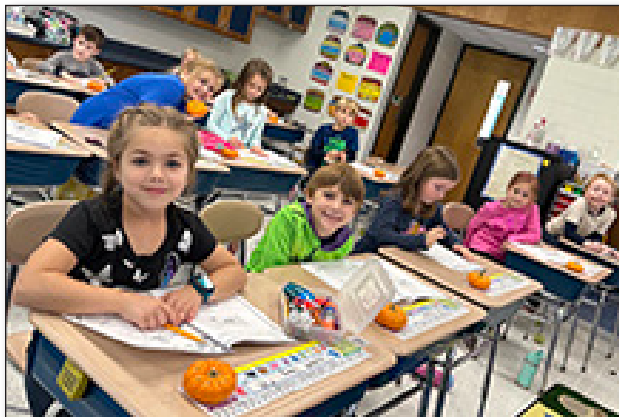
In October, first-graders at Big Flats used pumpkins to help them build science and math skills - and celebrate autumn. Each student received a small pumpkin to measure, count the lines, and weigh.

State law requires that all property within a municipality be assessed at a uniform percentage of market value. In the summer, the state sets equalization rates, which are meant to equalize the assessments from one municipality to the other.