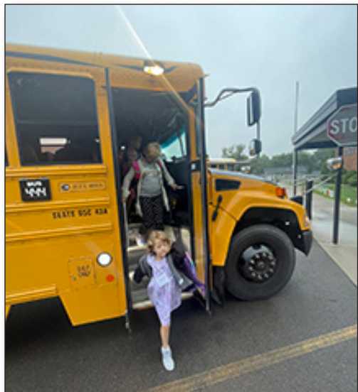
Currently, the district has 74 buses and six other student transportation vehicles.

Each year, voters are asked to vote on the purchase of buses. This allows the district to borrow funds to replace buses that are ten years old or older and have 100,000 miles or more. This replacement process meets New York State Education Department recommendations for maintenance and replacement of a bus fleet.