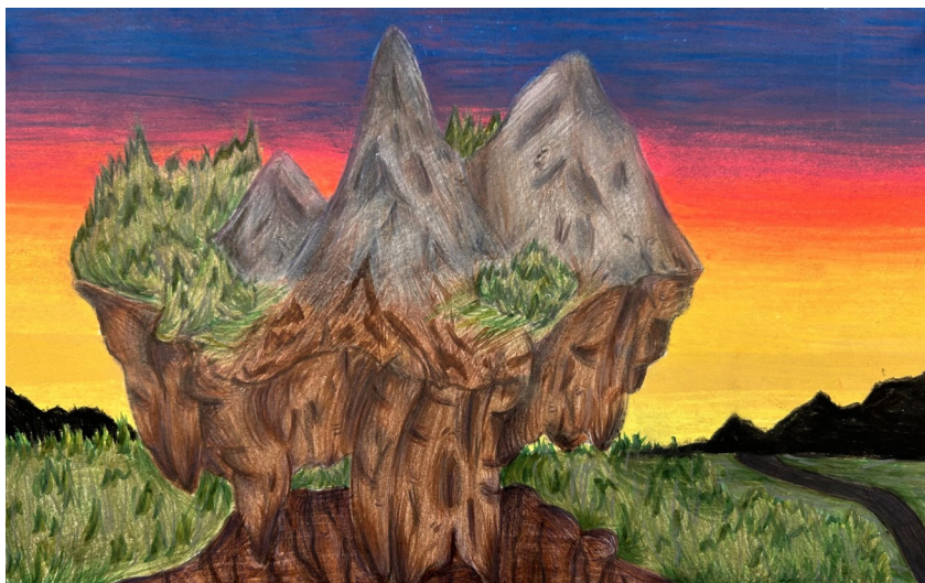
Calais Moore Silver Key