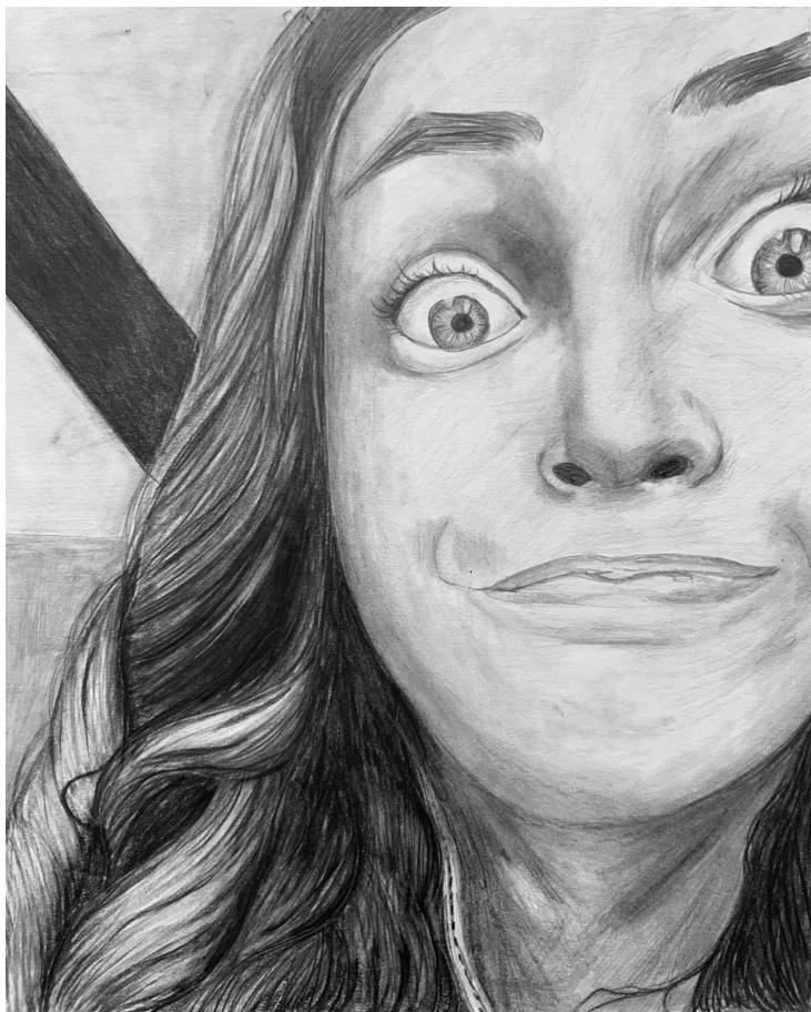
Lake Sena - "Seriously" Gold Key