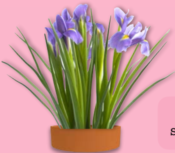
Blue Irises symbols of hope

Use your Digital Citizen Skills to have the best 2021 that you can. Don't give up hope.