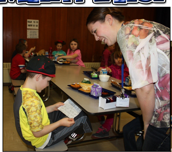
DAY.... Photos... Great Job!