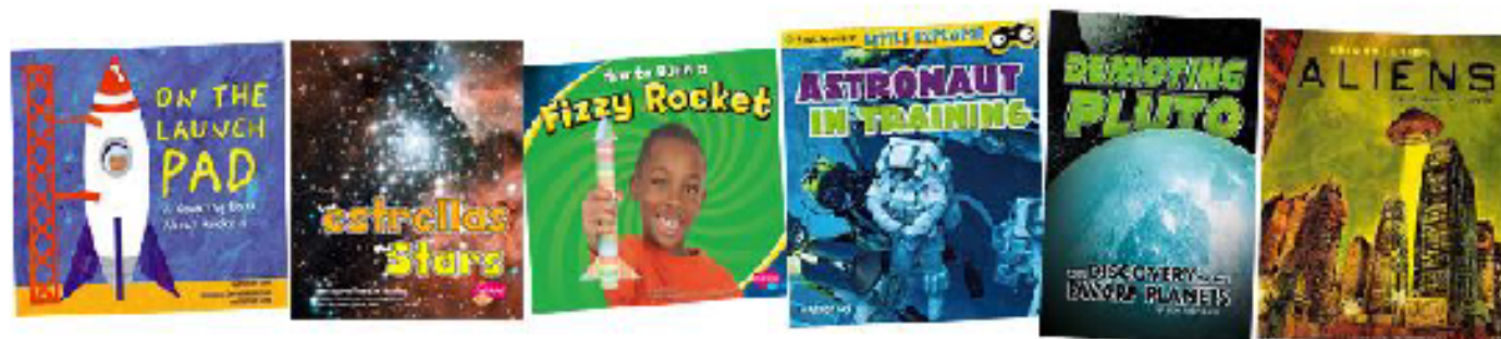
A sampling of space-related texts from the myON digital library