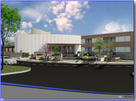
New architects' rendering of the main entrance at the High School.

At the October 18 Board of Education meeting, representatives from Hunt Architects, Engineers, and Surveyors and Welliver Construction reported to the board on the status of the district-wide capital improvement project.