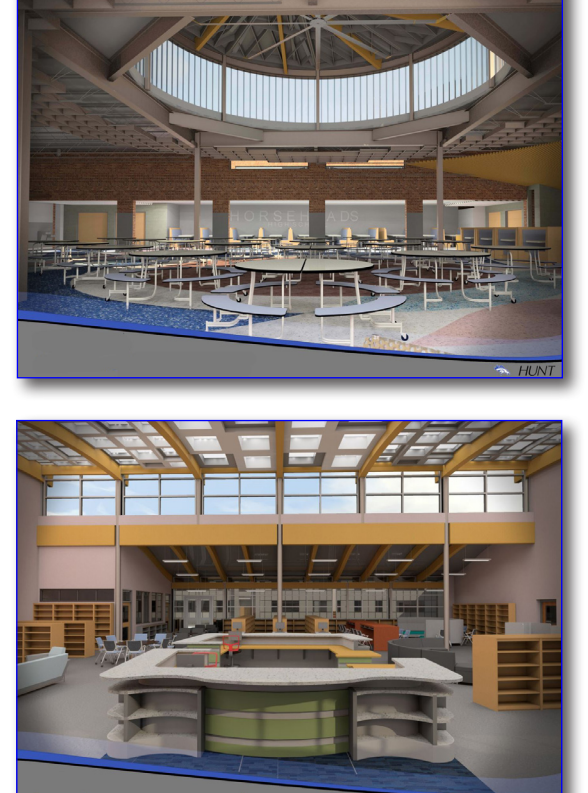
New architects' renderings of the cafeteria and library at the High School.

The High School project includes a new main entrance/offices where the current library stands, new library near the current pool, classroom additions and renovations, original boiler replacement, new multi-purpose stadium, cafeteria upgrades, rooftop HVAC replacements, and new parking areas and traffic flow improvements.