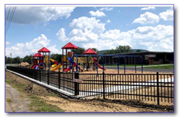
During the summer, playgrounds were replaced at Ridge Road, and a high-impact safety fence was installed at the corner of Ridge and Wygant roads.

For more background on the capital improvement project, <u>click here.</u>