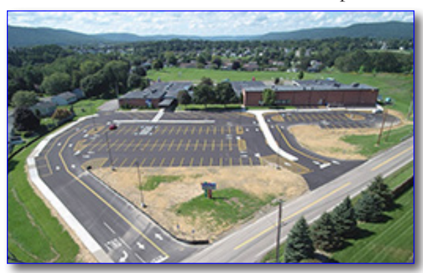
During the summer, the entire parking area at Gardner Road Elementary School was replaced, and traffic patterns were changed to separate bus traffic from car traffic.

Due to the weather this summer, portions of the roofing projects across the district could not be com-