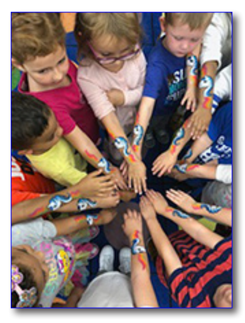
Ridge Road held their annual Fun Run in September.