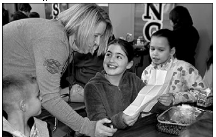
From Center Street's Poem in Your Pocket Day April 3.

The most recent information available from the New York State Education Department, from 2014-15, shows the average expenditures per pupil in Horseheads to be more than $4,000 lower than in districts similar to Horseheads, and more than $5,100 lower than the state average.