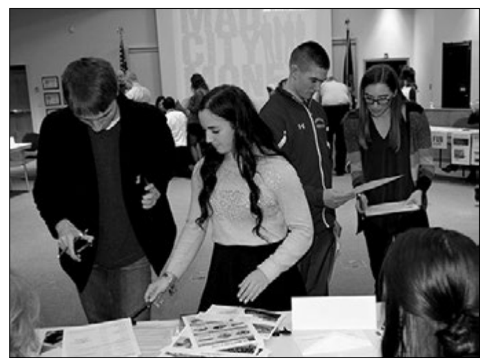
Through Corning Credit Union's Mad City Money program, High School students learn the basics of budgeting, bill-paying, saving, and unexpected expenses in a real-life simulation.