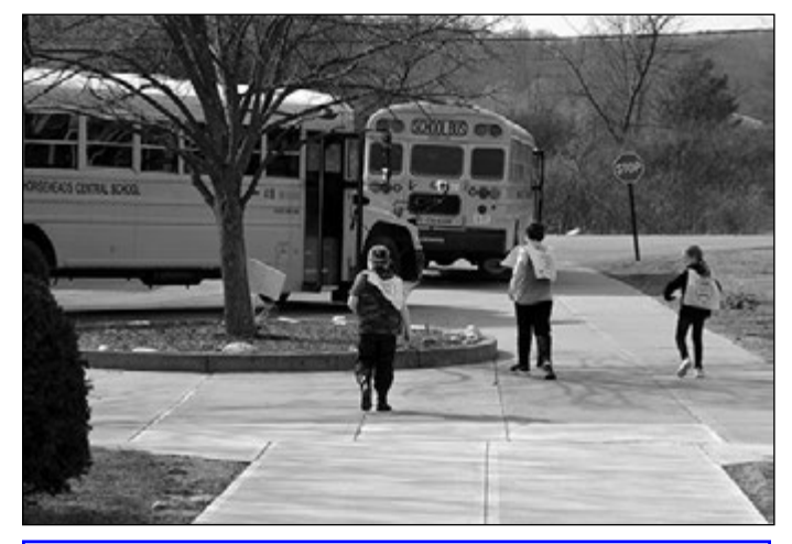
Vote May 16, 7am-9pm Big Flats/Ridge Road/High School

Below: members of Ridge Road's Safety Patrol head out to their posts at dismissal March 6.