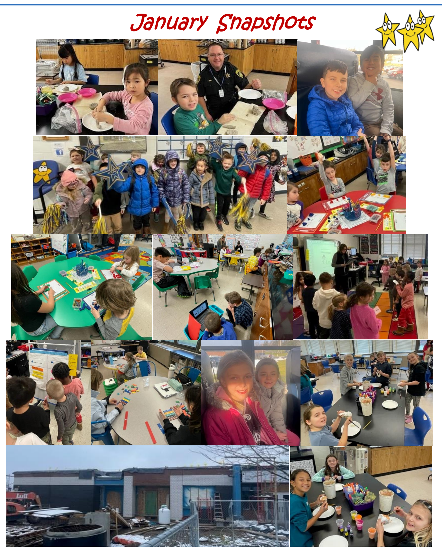
Check out more photos and events on our Facebook Page!